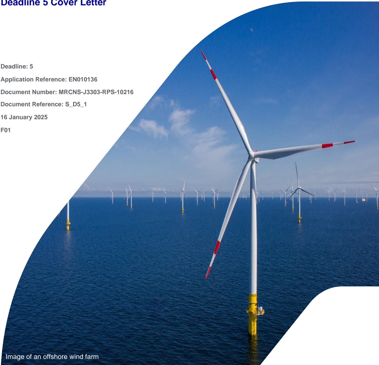
Image of an offshore wind farm